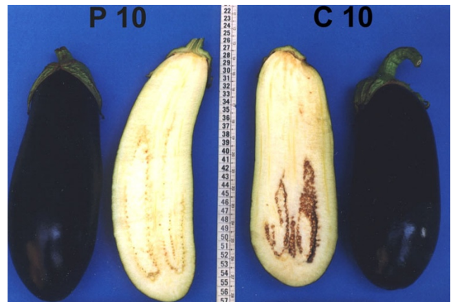
Figure 2 Eggplant fruits from the open field summer trial. Left, uncut and cut fruit of the transgenic hybrid PI0; Right, cut and uncut fruit of the CI0 control hybrid.

To determine whether expression of the DefH9-iaaM gene also occurs during later stages of fruit growth and whether it is influenced by pollen fertilization, mRNA from transgenic flowers and fruits obtained either from emasculated or hand pollinated flowers was analyzed by RT-PCR at different stages of development, until the fruit attained a length of 28 cm. An amplicon of 161 bp corresponding to the spliced DefH9-iaaM mRNA was detected in all stages analyzed (Fig. 3, lanes 2–6). Thus, the presence of the mRNA of the DefH9-iaaM gene and consequently its action is most likely not limited to early stages of flower and fruit development. Pollination did not affect the steady state level of DefH9-iaaM mRNA (Fig. 3, compare lane 5 and lane 6).