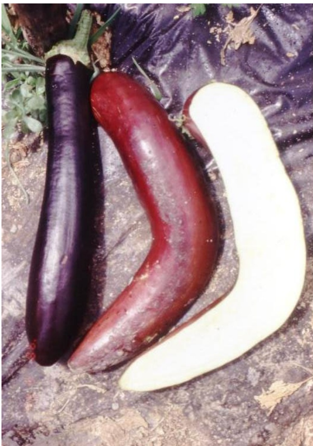
Figure 1 Eggplant fruits of the transgenic parthenocarpic hybrid PI from the greenhouse spring trial. Left: fruit at the stage of commercial ripeness; middle: an overripe eggplant fruit from a border plant; right: a longitudinally cut fruit showing the complete absence of seeds.

For each trait, at least one common letter indicates no significant difference according to the Duncan test ( P = 0.05 ). Mean value of yields per plant, number of fruits and fruit weight of two transgenic hybrids (PI and PI0) and their corresponding untransformed hybrids (CI and CI0), cultivated during summertime under open field conditions.